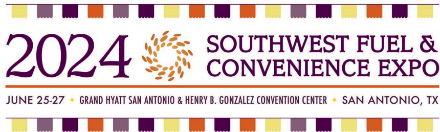
EXHIBIT SPACE TERMS & CONDITIONS AND RULES & REGULATIONS

1. SPONSOR: The 2024 Southwest Fuel & Convenience Expo is sponsored by the Texas Food & Fuel Association, 401 W 15th St., Suite 510, Austin, TX. For purposes of this document, the sponsor may be designated as the “Association” or “Show Management.”