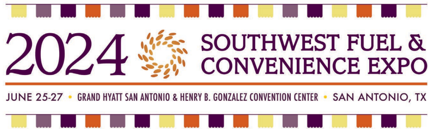
EXHIBIT SPACE TERMS & CONDITIONS AND RULES & REGULATIONS

29. SMOKING: Smoking is not permitted in the Exhibit Hall and all attendees and exhibitors must conform to smoking laws in place at the Fort Worth Convention Center.